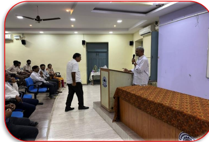
Steel Casting Defects with Remedies' Class Room Training Program Conducted at HAIL Anapalli Dt.27.03.2024